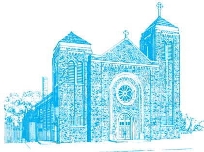
St. John Nepomuc