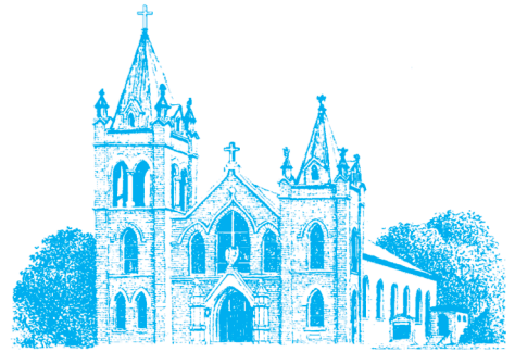
St. Gabriel Archangel