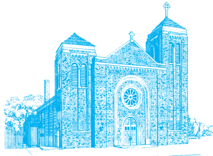
St. John Nepomuc