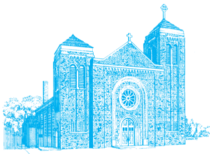
St. John Nepomuc