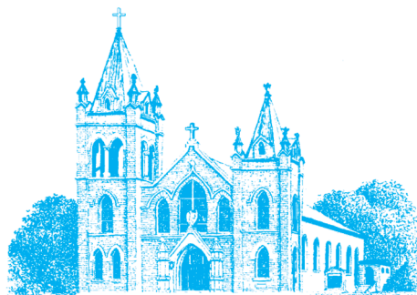
St. Gabriel Archangel