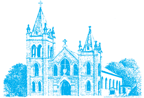
St. Gabriel Archangel