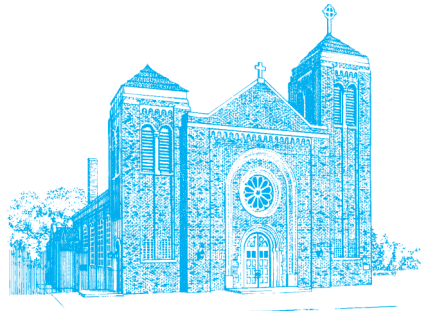
St. John Nepomuc