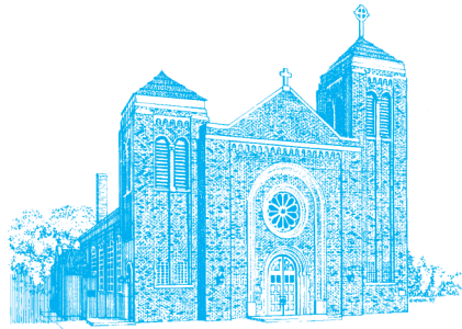
St. John Nepomuc