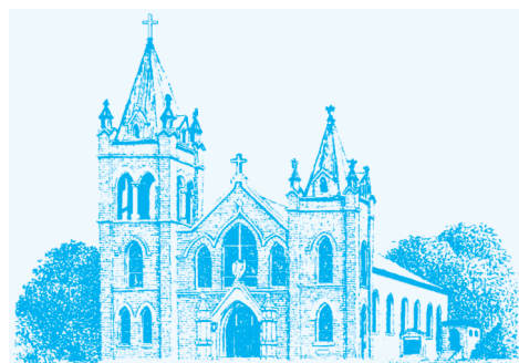
St. Gabriel Archangel