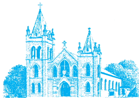
St. Gabriel Archangel

ALL MASSES will be at St. Gabriel's Church starting on Tuesday, August 27th until further notice. We will be painting the interior of St. John's Church. Also Tuesday & Wednesday Masses are now at 8:15 am.