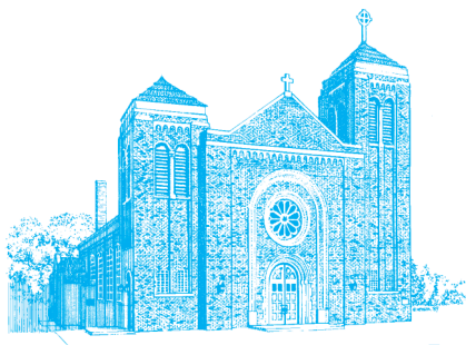
St. John Nepomuc